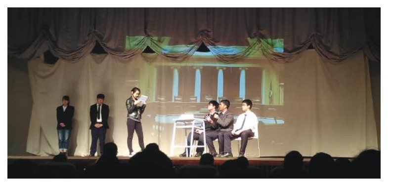
Gr. 9 St. Raymond - Two States