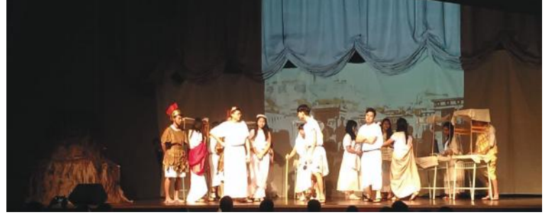
Gr. 11 St. Anthony - Pompeii