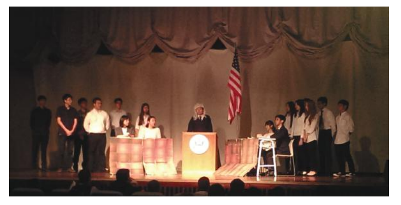
Gr. 10 St. Albert - The Edge