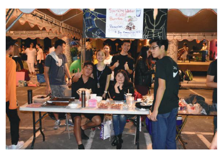
Gr. 11 St. Louis Booth