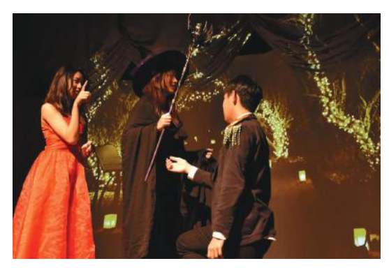
Gr. 10 St. Peter — Blush Hour