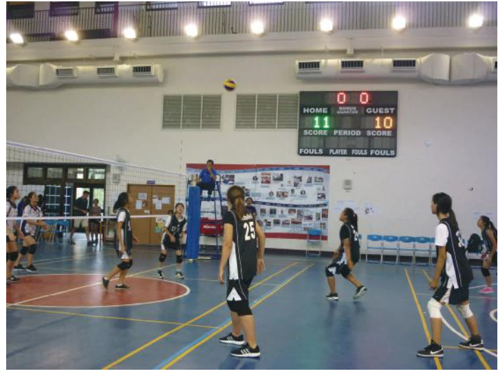
DIS Team 1 vs. MAC