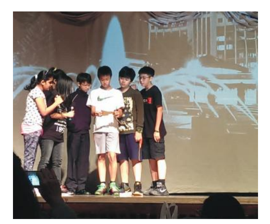
Gr. 7 St. Thomas - Escaping the Nightmare