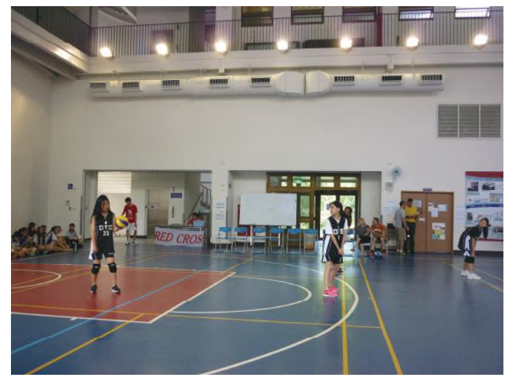
DIS Team 2 vs. TES