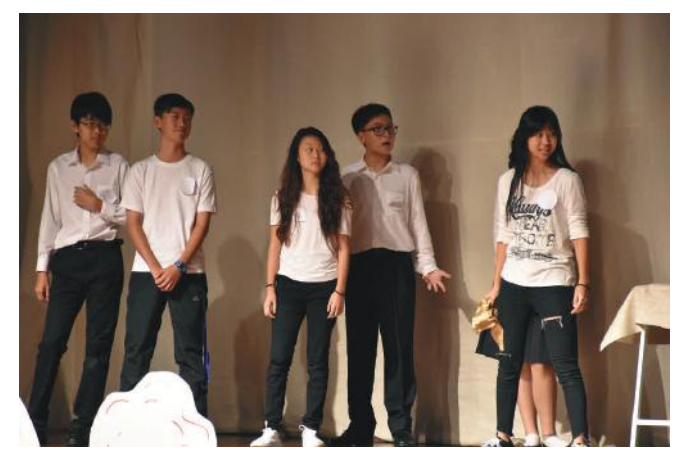
Gr. 8 St. Agnes — The One Choice