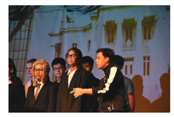
Gr. 9 St. Rose — Before the Fight