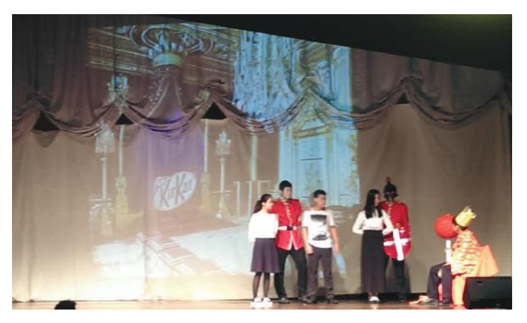
Gr. 8 St. Catherine - Forgive Me, My Friend