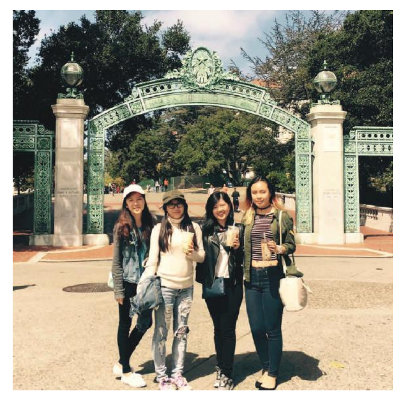
What advice or word of encouragement would you like to give our current Dominican students regarding their preparation for college?

"To be honest, my high school education has helped me a lot in college. I often hear that DIS has [a heavier] workload than other schools [and that] we also [have] to take more mandatory subjects; [this is a reason] I found it easier to get used to the workload in college. The coursework I took [in high school] also helped me. For instance, the math content for my current math course covers many things [I had learnt] from AP Calculus. For my English class, I have to write papers [that are] similar to [the ones I had to write in] Research Method and Senior Project. [With] such experiences, I have a [good] direction of what to do in my class."