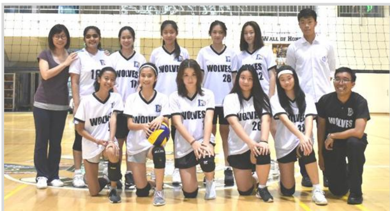
DIS JV Girls Volleyball Team went to the TISSA Finals